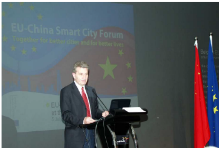
Energy Commissioner Oettinger at EU-China Smart City Forum